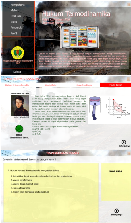
Figure 1. Example of Interactive Multimedia Displays and Related Information

The main menu consists of "competency", "material", "evaluation", "literature", "guidance", and "profile" of the media. Students could use this media interactively by selecting the corresponding menu.